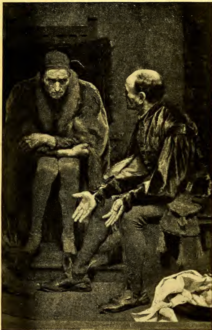
LOUIS XI. AND HIS MINISTER, OLIVIER LE DAIN.